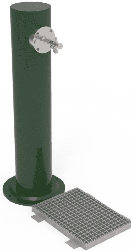
Nickel-Plated Tap UM510G